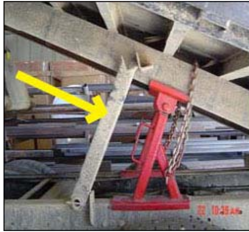
Figure 4. Positive supports are provided by dump bed manufacturers in the form of body props. Body props are non-adjustable and will support the dump body at one position only.

For problems with accessibility in using figures and illustrations in this document, please contact the Directorate of Science, Technology and Medicine at (202) 693-2300.