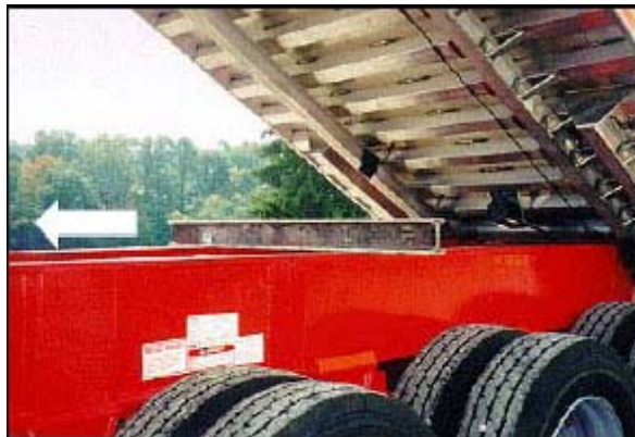
Figure 3. Shows a steel I-beam makeshift body prop: steel I-beam sits across truck frame. The I-beam is not attached to the truck frame or dump body. The I-beam could be displaced in the direction of the arrow by the inadvertent movement of the dump body or truck frame.

For problems with accessibility in using figures and illustrations in this document, please contact the Directorate of Science, Technology and Medicine at (202) 693-2300.