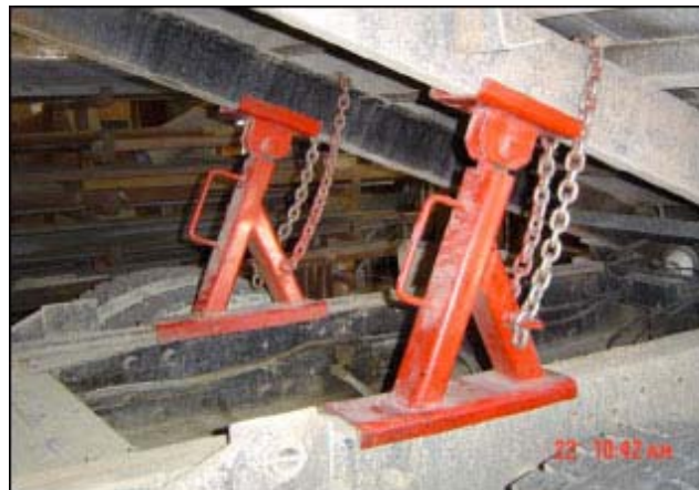
Figure 5. Engineered truck bed brace brackets.

The following is an example of the prototype truck bed brace brackets (see Figures 5, 6 and 7) that were developed by the employer and can be used universally on any brand of dump box. The standard flange is 3.5 inches and the braces will fit up to a 4.5 inch channel. In addition, these braces have a handle that allows the employee to place the brace under the dump box without creating an additional hazard. The employee must rest the brace on the frame of the truck while standing next to the tires.