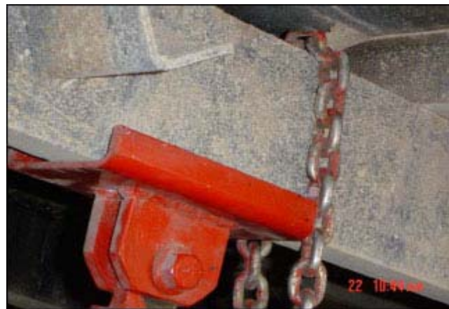
Figure 7. Truck bed brace bracket (top channel supporting dump body.)

For problems with accessibility in using figures and illustrations in this document, please contact the Directorate of Science, Technology and Medicine at (202) 693-2300.