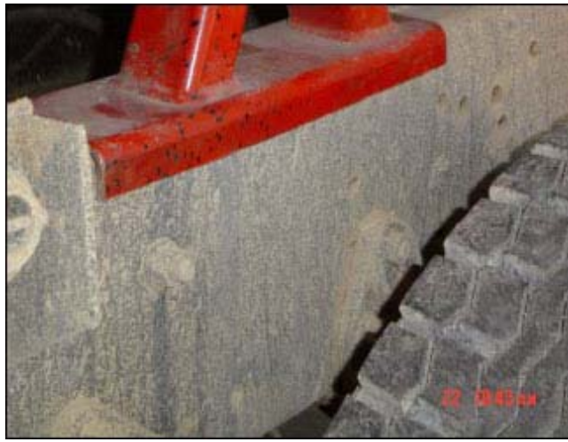
Figure 6. Truck bed brace bracket (bottom channel).

For problems with accessibility in using figures and illustrations in this document, please contact the Directorate of Science, Technology and Medicine at (202) 693-2300.